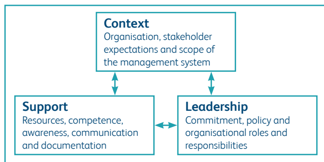
Figure 1: Scope and design components of management systems